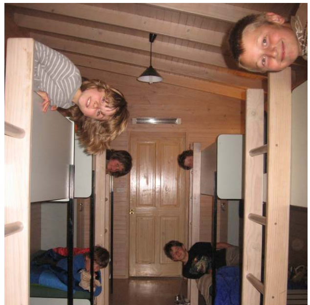
The boys cabin.