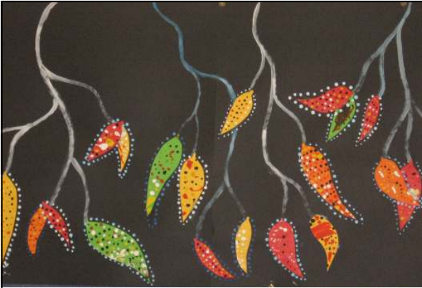
Aboriginal Artwork done by the children