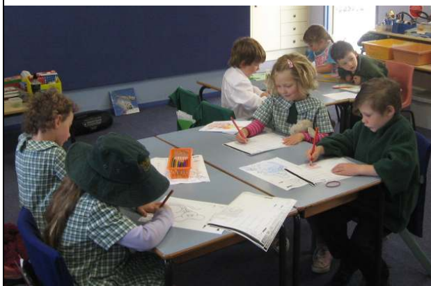
Our Kinders 2011 working enthusiastically on the tasks given to them.

On Wednesday 24th November Wingecarribee Council will present the RTA's road safety presentation; "Street Sense for Kindergartens". All Penrose parents are welcome to participate.