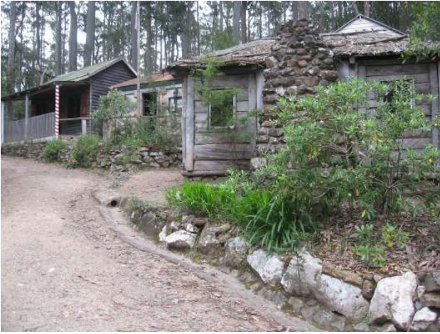
The main street in Old Mogo Town.