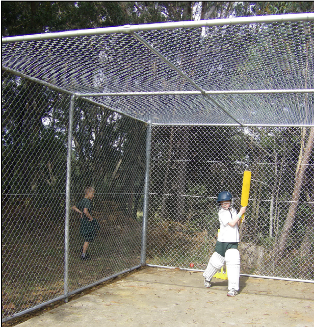
Thomas testing out the new cricket nets.