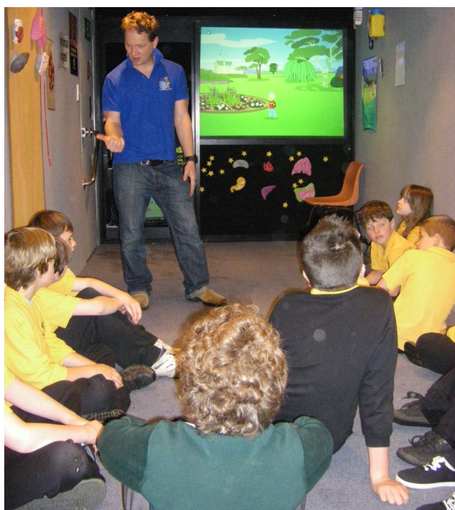
A class lesson inside the Life Education Van

Don't forget to dress up for our Luau themed Book Fair. Wear your grass skirts or favourite Hawaiian shirts and feast your eyes on the many wonderful books we have for you to purchase. The children would love it if the adults could dress up too.