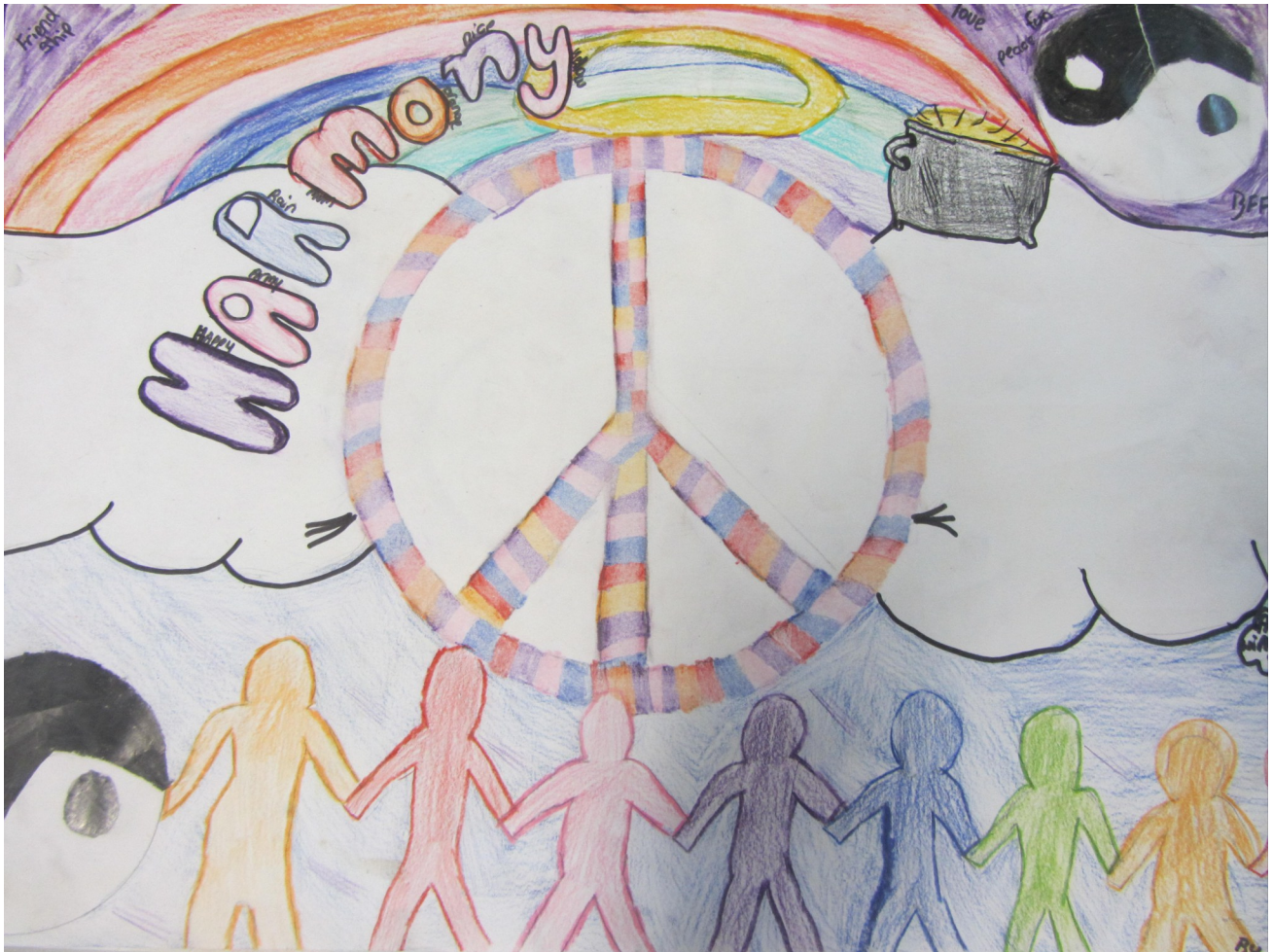
Poster by Shyanne acknowledging the importance of friendship no matter what our differences - to celebrate our differences!