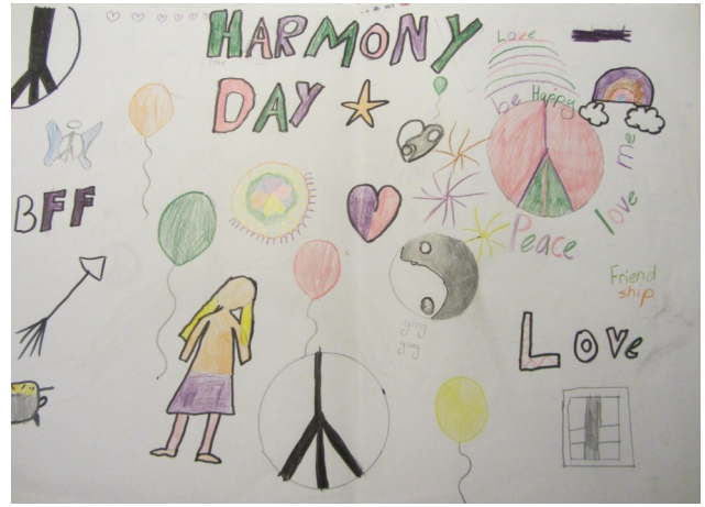
Harmony Day poster by Amelie