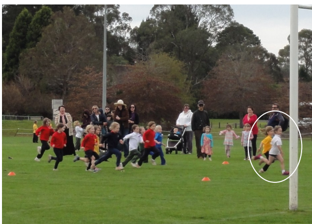
Mischia steaming ahead in the 100 metres.