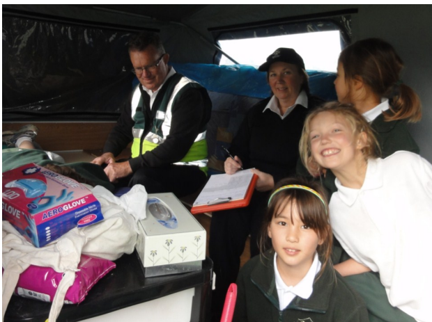
Students checking out the First Aid Truck at the Carnival.