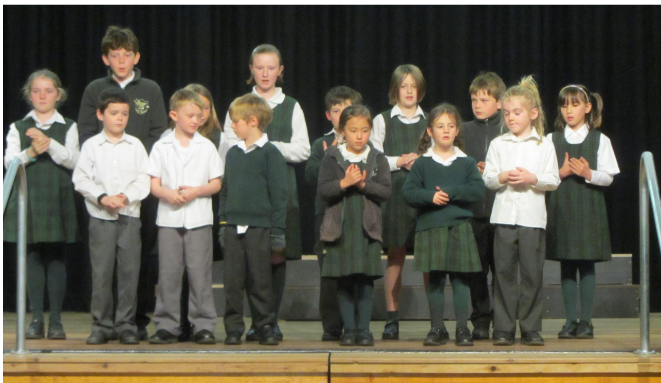
School Choir performing the song "We are accustomed to the force".