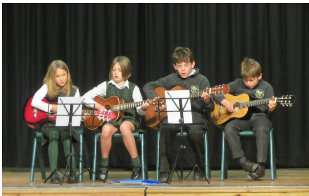
Our Guitar Group performed "Rockin Robin".