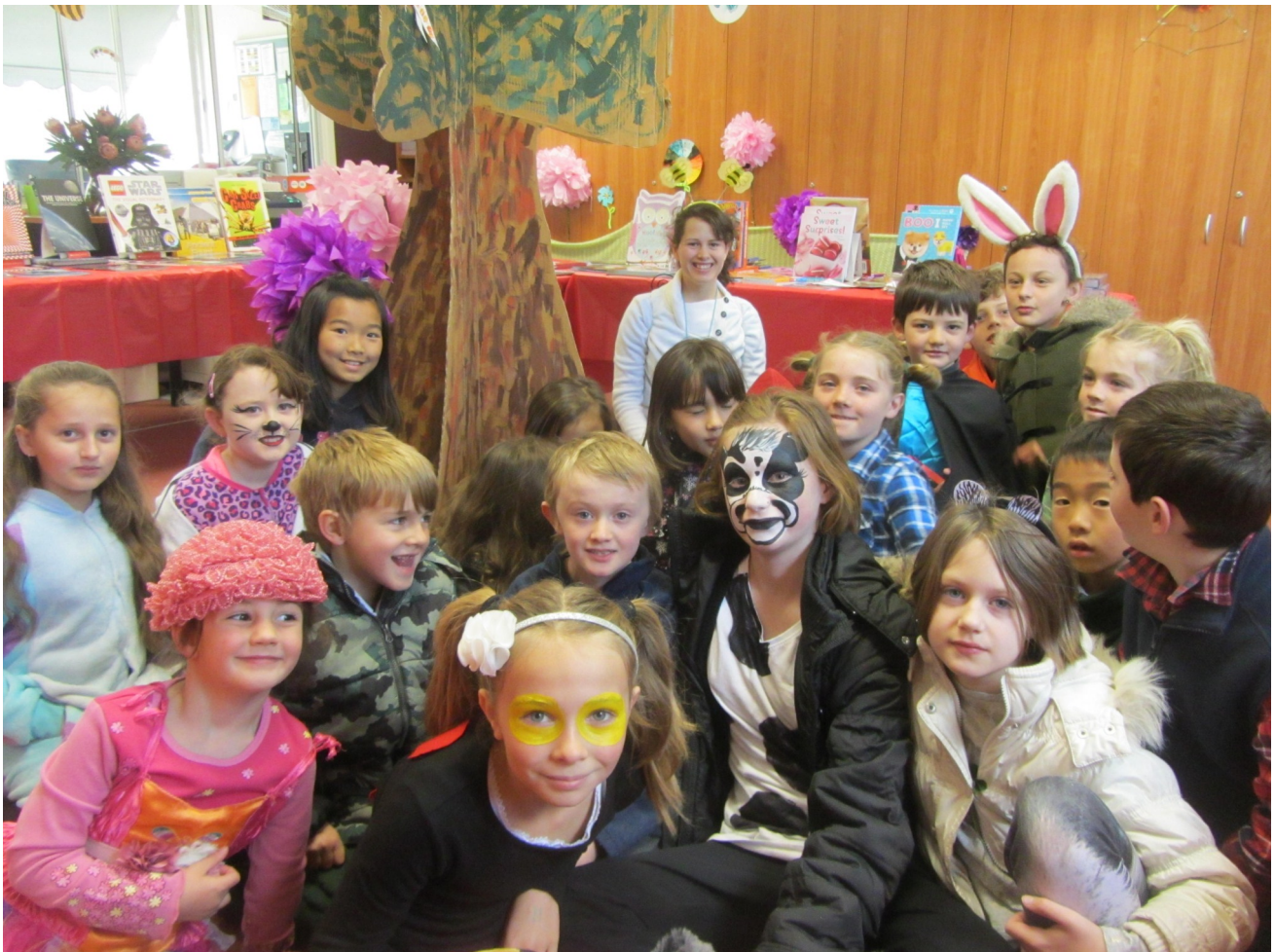
Students enjoyed the Garden Book Fair during Education Week

In its 120th year Penrose Public School encourages confidence, responsibility, awareness and adventure.