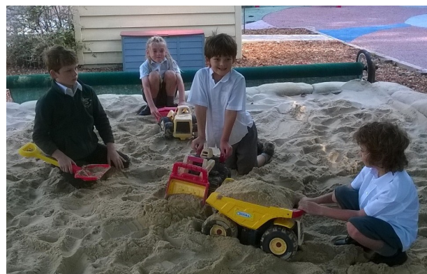
The boys re-arranging the sandpit