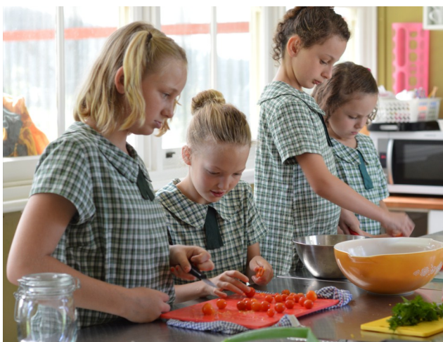
Students preparing the tomato salad from the garden