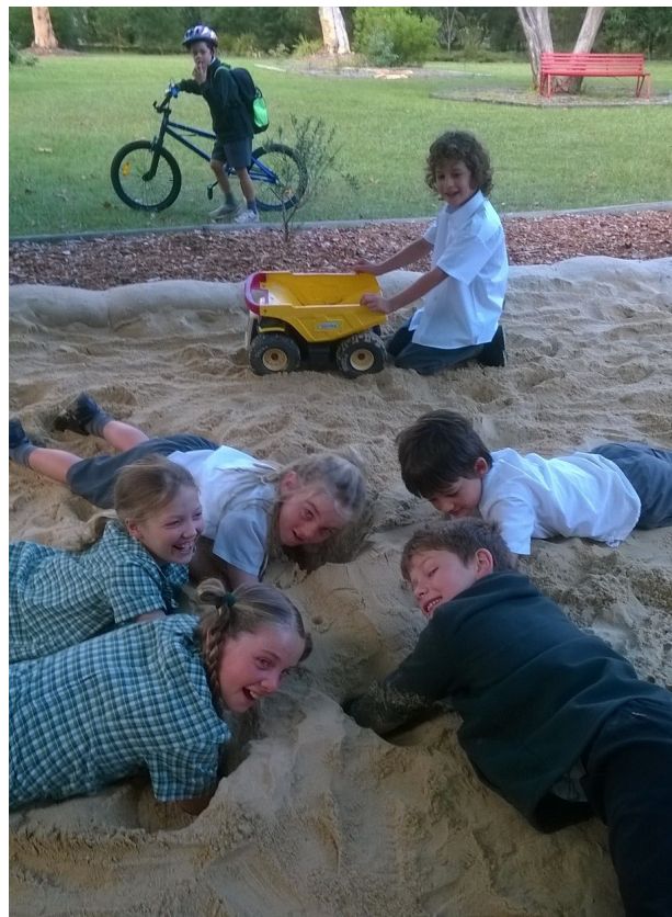
Look ... No Arms

In its 124th year Penrose Public School encourages confidence, responsibility, awareness and adventure.