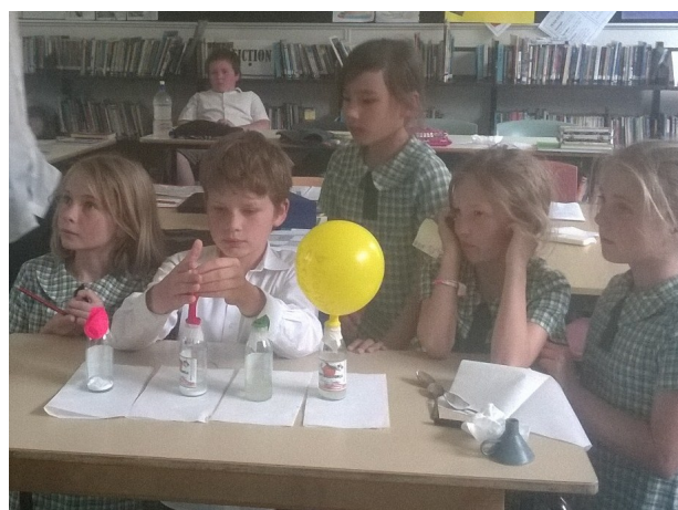
Students waiting for their chemical reaction to happen

Well Done to all our students who placed entries into this year's Show.