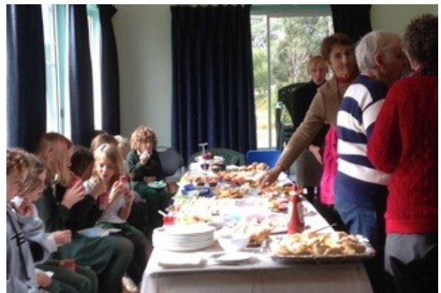
The delicious spread put on by the community.