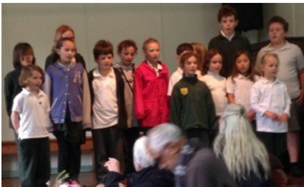
The school Choir performing in front of a supportive audience

Please note on your calendars the Life Education Van at Wingello School (3rd June) has been cancelled this year as well as "Doing Things Together Day" (27th May) by the hosting school.