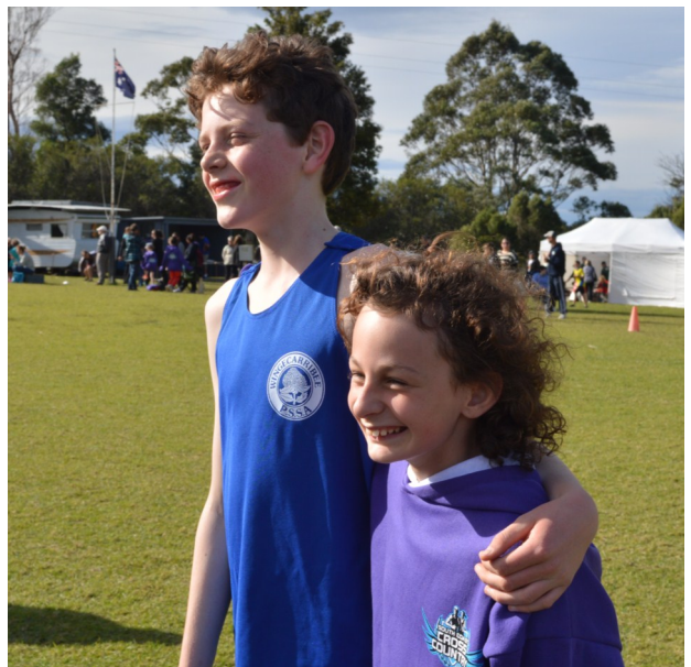
Team Penrose - both very proud to support their school