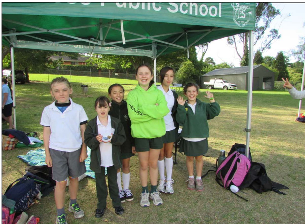
Penrose cheer leaders ready to cheer for the next race.